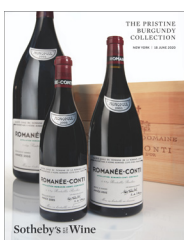
The Pristine Burgundy Collection New York June 18

During the COVID period, Sotheby's Wine presented 5 single owner auctions totaling over $26 million, representing 58% of sales, selling at 50% above the low estimate, confirming the enduring value of great condition and provenance.