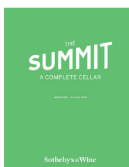
The Summit, A Complete Cellar Hong Kong July 5-6