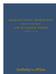
Magnificent Bordeaux from the Cellar of Sir Dickson Poon Hong Kong July 6